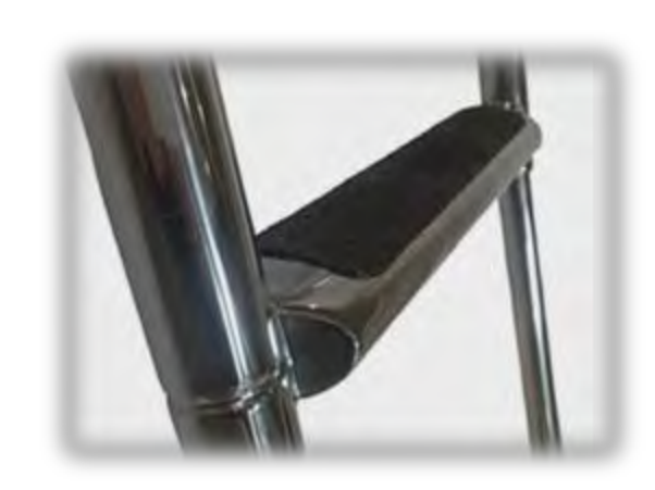
Premium- step (telescope & spring lock)

Premium -steps are made of shaped oval tube to provide the best outlook and feel on the foot. Premium -steps can give any boat model good looking final touch and create prestige image.