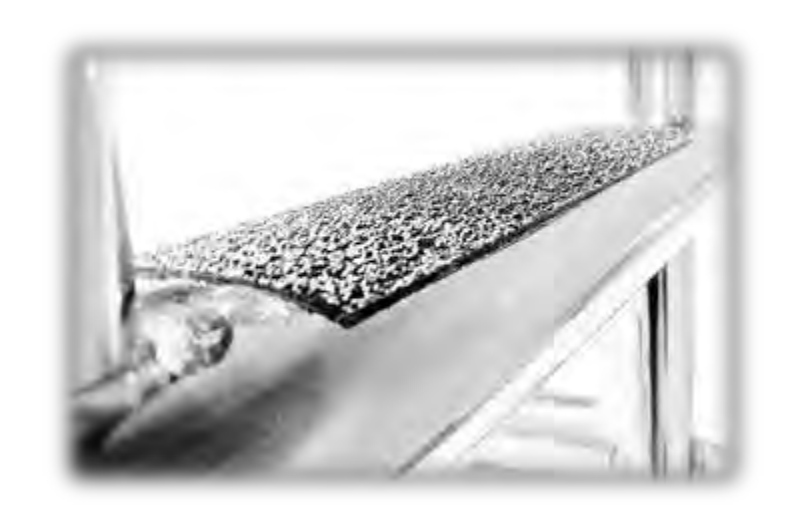
Premium- step (foldable)

Economy -steps are made of flattened round tube with plastic covering (white or black).